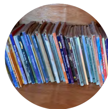
Condition of Existing Books