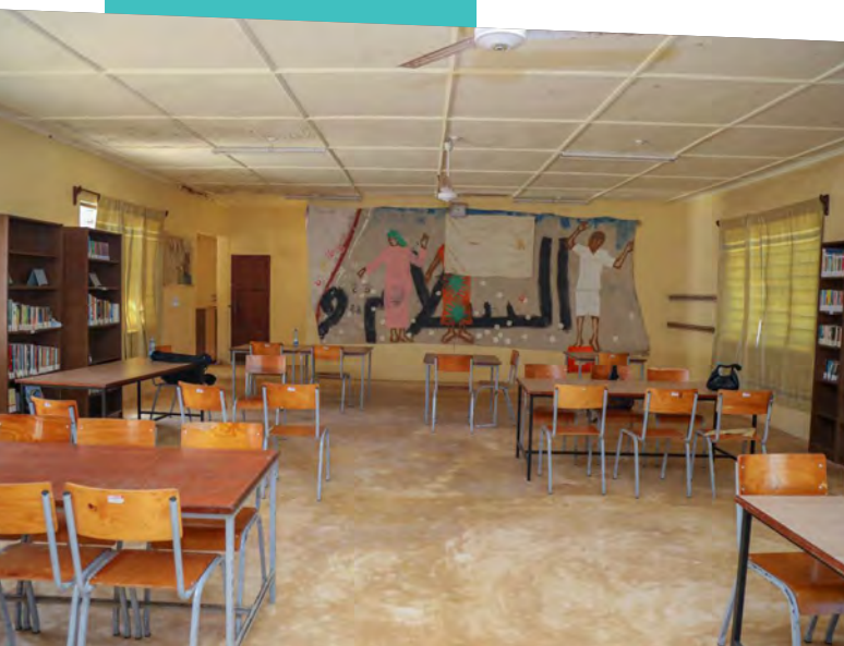
Bright Girls Library