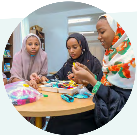
Students at Shella Primary building robots.