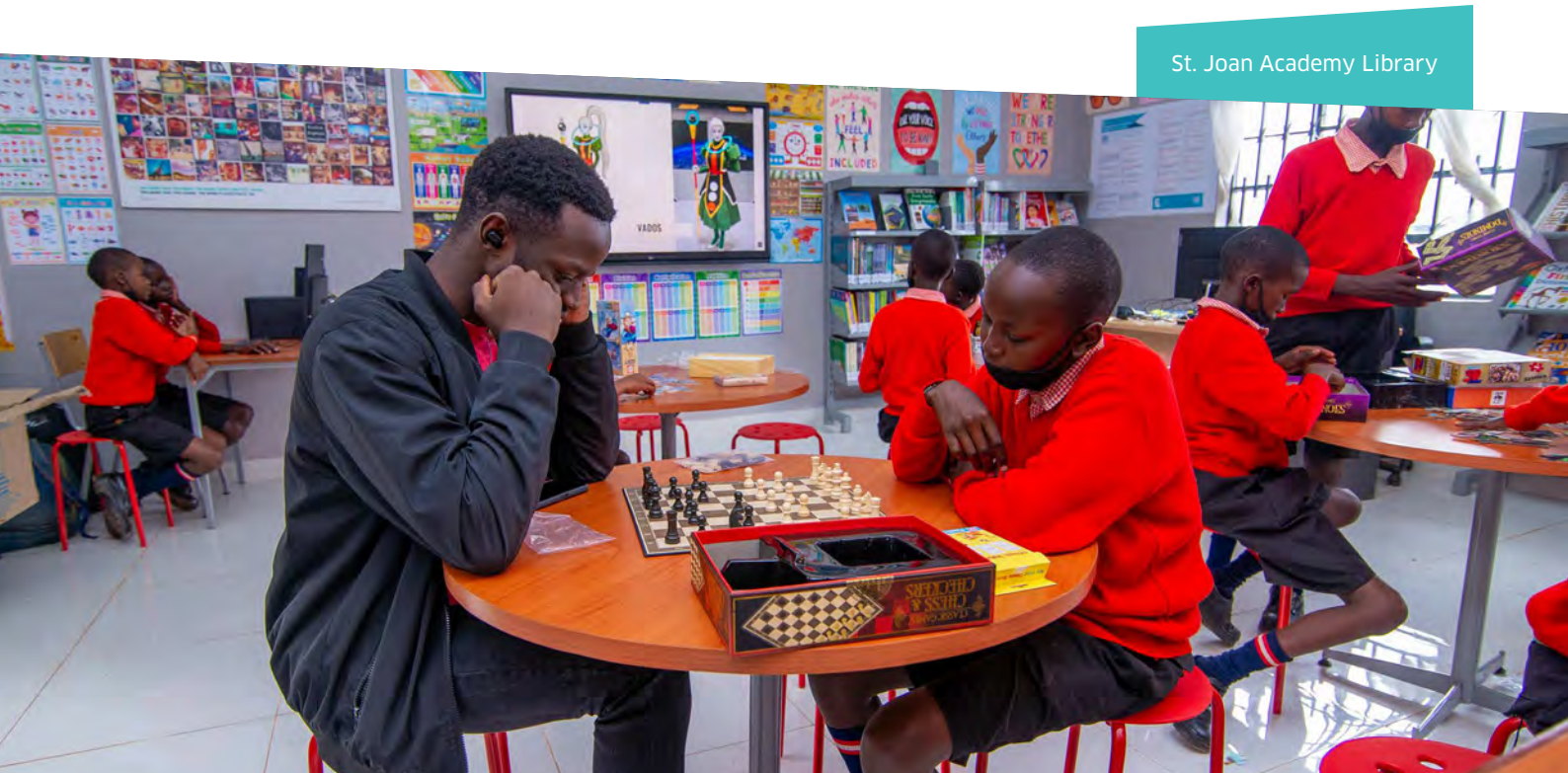
St. Joan Academy Library