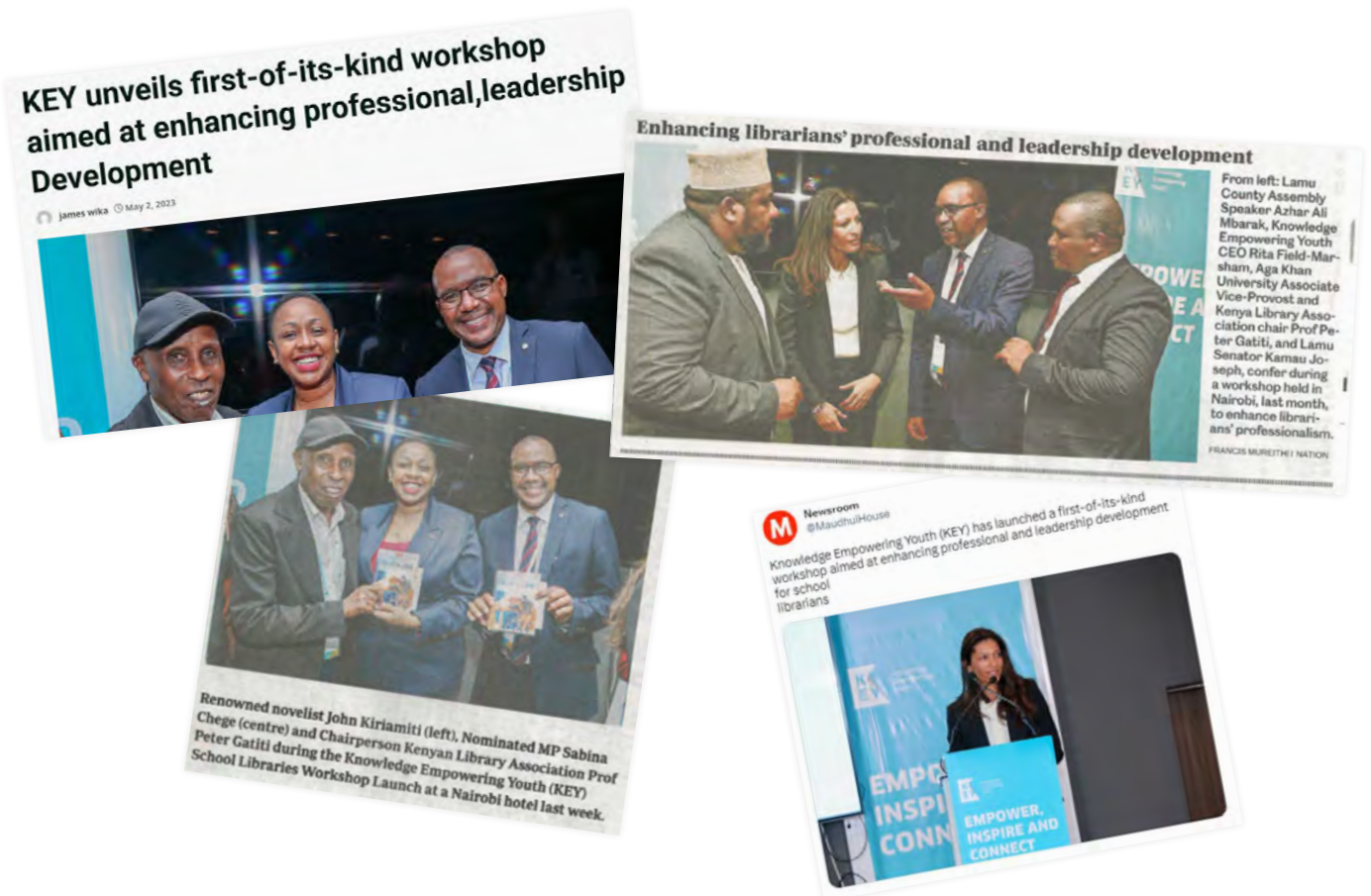
From Left to Right: Business Quest, May 2nd 2023; Daily Nation, June 5th 2023; The Standard, May 1st 2023; Newsroom, via Twitter