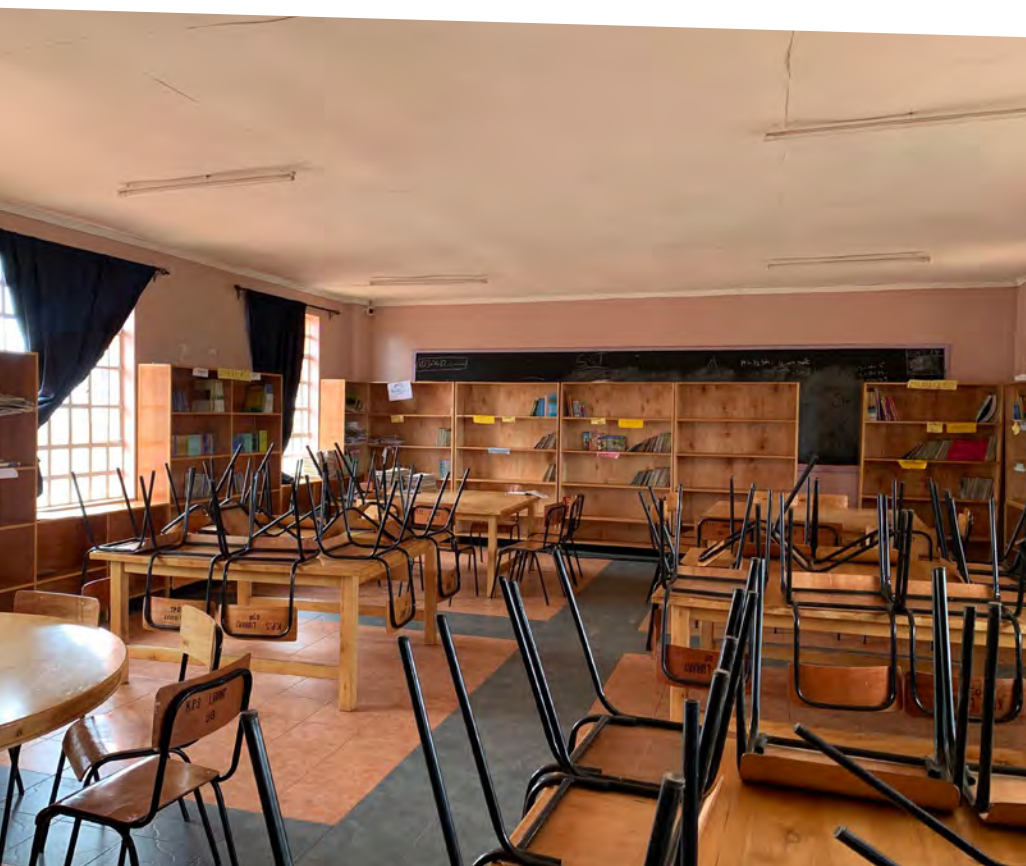
Furniture Donated by Other Partners