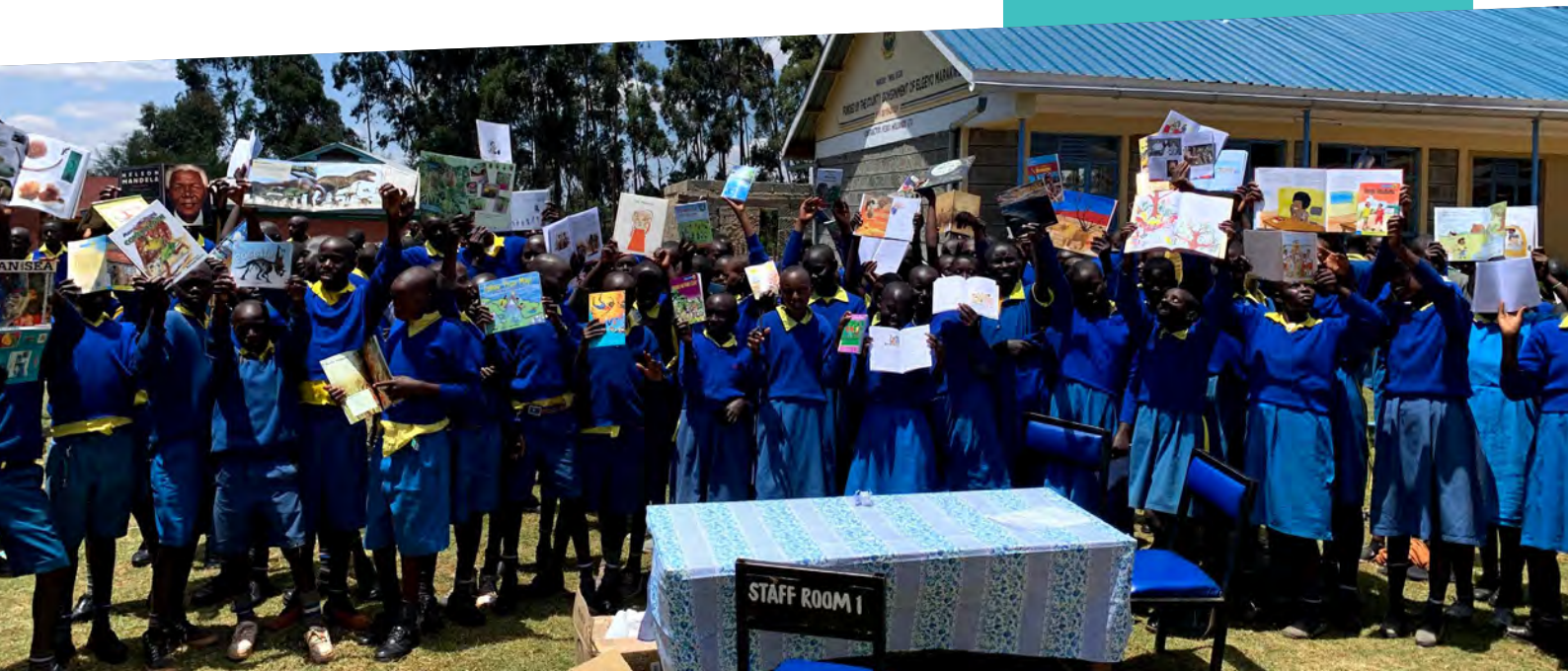
Mokwo Mixed Day and Boarding Primary

Looking ahead to 2024, KEY will restore under-resourced libraries, expand regionally, and deepen its impact on reading culture and innovation in schools, advancing SDG 4 (Quality Education) and SDG 10 (Reduced Inequalities).