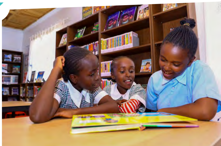
Photos of the Library After Refurbishing