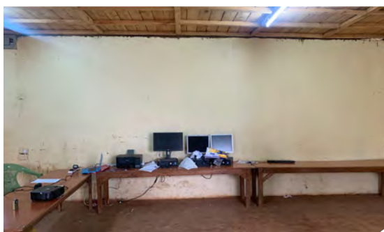
Photos of the Library Before Refurbishing

The school was identified for its strong potential and clear need for enhanced learning resources. Through KEY, students and teachers now have access to a well-equipped reading space stocked with age-appropriate and diverse books, computers, interactive board, furniture and games. The library is a significant step toward strengthening the reading culture in the area, offering a supportive environment that encourages curiosity, independent learning, and improved academic outcomes.