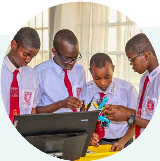
Students at Kapsabet building robots.

The collaboration reflects KEY's commitment to bridging the digital divide and preparing young learners in both rural and urban settings for the demands of the 21st century.