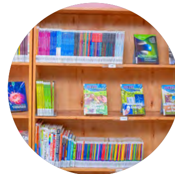
Upgraded Library Books