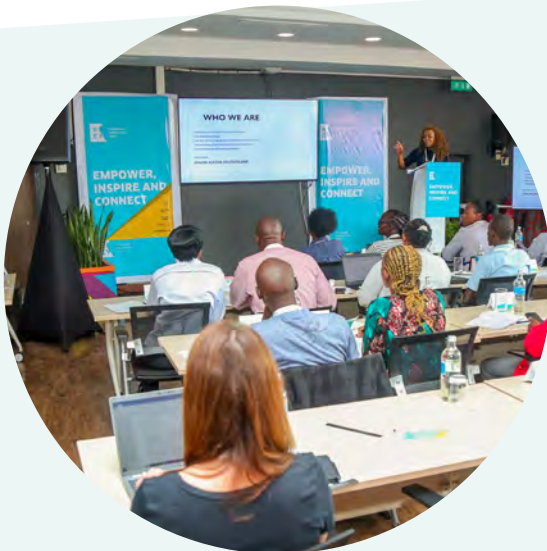
The workshop equipped librarians with practical skills.

“Each session at the workshop was not only insightful but also engaging. The level of organisation, range of presentation topics and the content was timely. The social events and informal gatherings enabled the meaningful exchange of ideas and collaborations that have proved beneficial to my personal professional growth and to that of the Kenya Library Association. I would highly recommend this workshop to more school librarians in the future.”