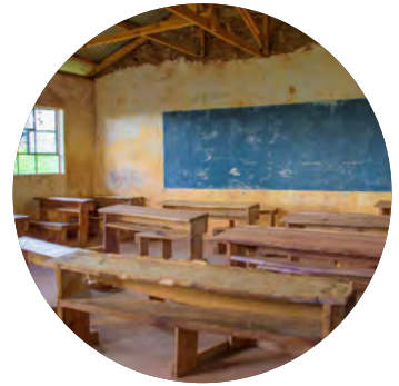
Before KEY involvement.

Once the building was complete, KEY, at his request, stepped in to fully resource the library and provide training for the librarian—ensuring the space became a vibrant and sustainable learning hub.