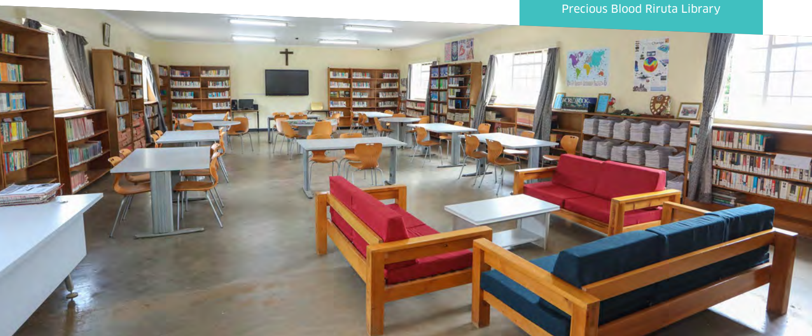
Precious Blood Riruta Library

Lewa Downs Primary has fully utilized its library since its establishment in 2015 and has extended access to the surrounding community. To support this growing demand, KEY supplied an interactive board to replace the faulty one, computers, games, and additional books.