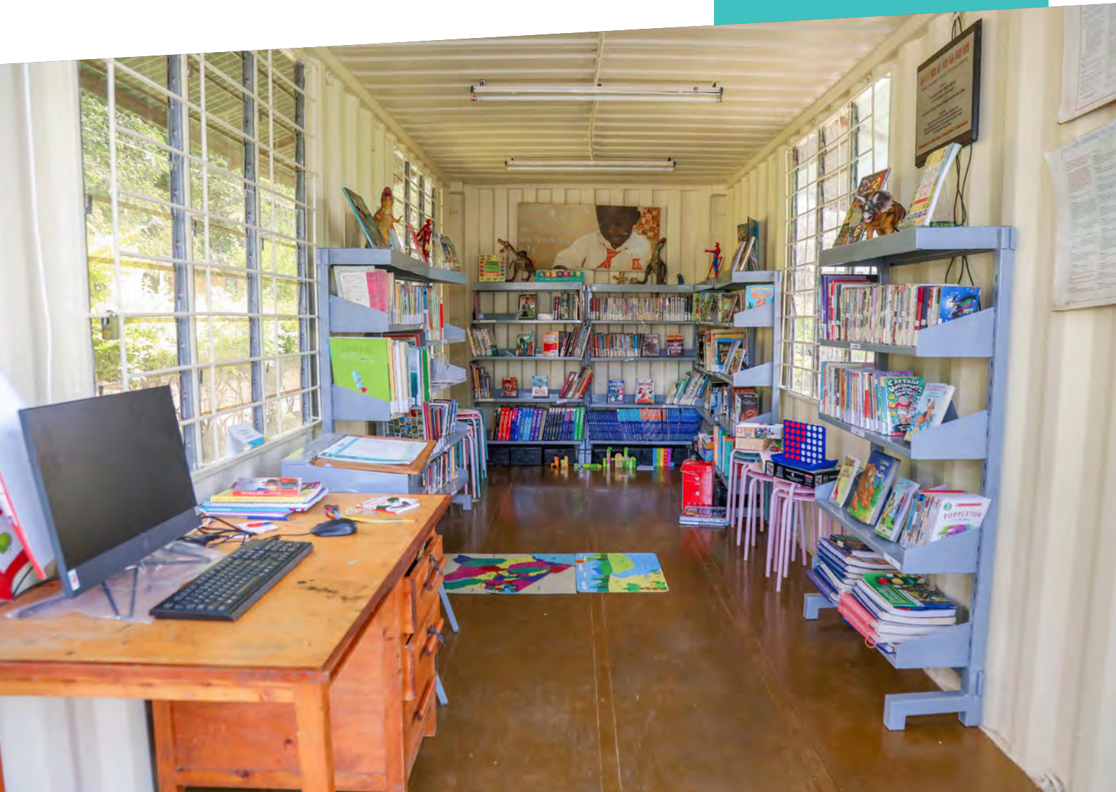
Muskut Primary School Library

Muskut Primary School has benefited from a container library since 2013. With time, the structure required renovations and resource upgrades. KEY responded by renovating the container providing a computer for the library management system, games and replenishing the book collection.