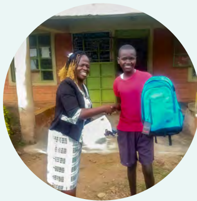
MUSKUT PRIMARY SCHOOL