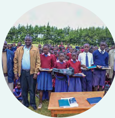
KAPCHORWA PRIMARY SCHOOL