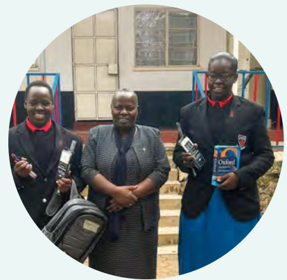
STAREHE GIRLS SECONDARY SCHOOL