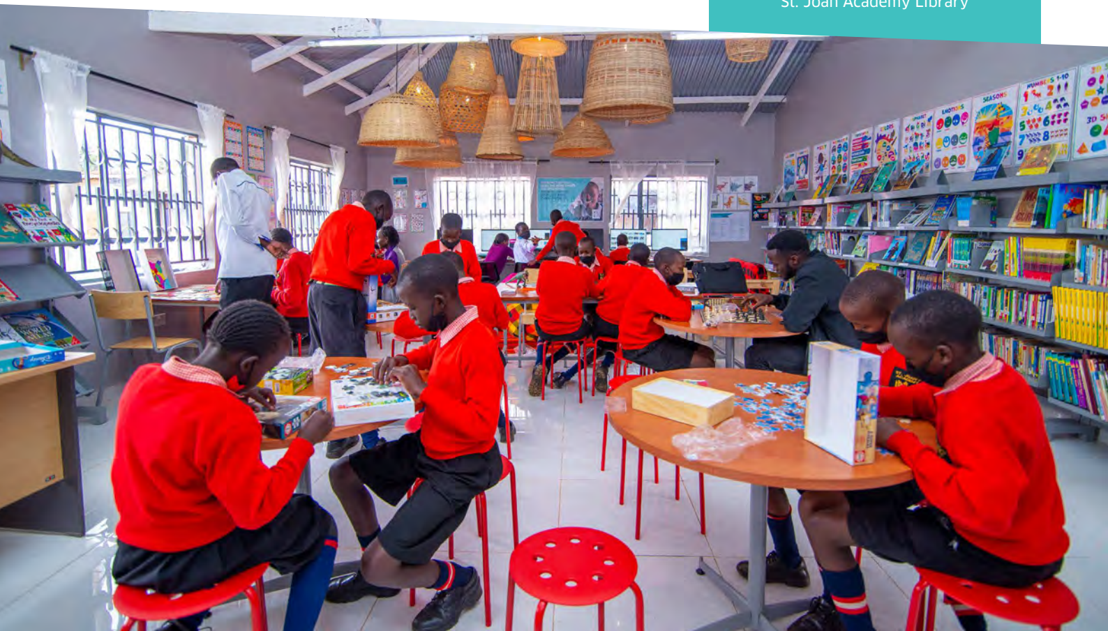
St. Joan Academy Library

New libraries, including Wajir Girls and Garissa Boys Secondary, are planned, along with upgrades to KNLS teen sections. Training programs for librarians and student leaders will launch, and fresh partnerships will drive our mission to make libraries central to learning and equity.