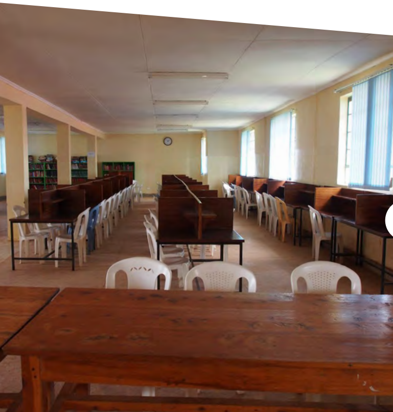
Before Renovation - 2017