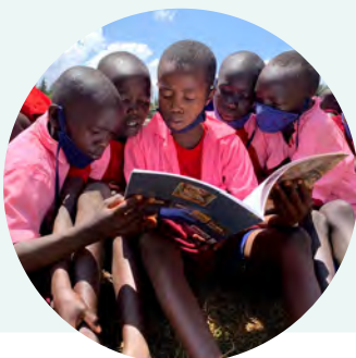
Students at Kapchorwa Day Primary School.