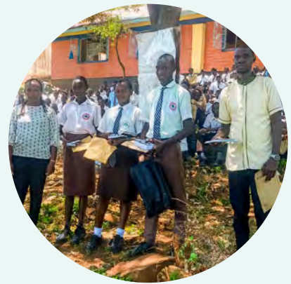
CHEPSIGOT MIXED DAY SECONDARY SCHOOL