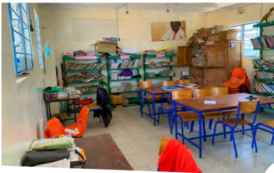
Photos of the Library Before Upgrade in 2023

Before-and-after photos highlight the transformation and underscore the importance of continued investment in creating safe, well-resourced, and inspiring spaces for education.