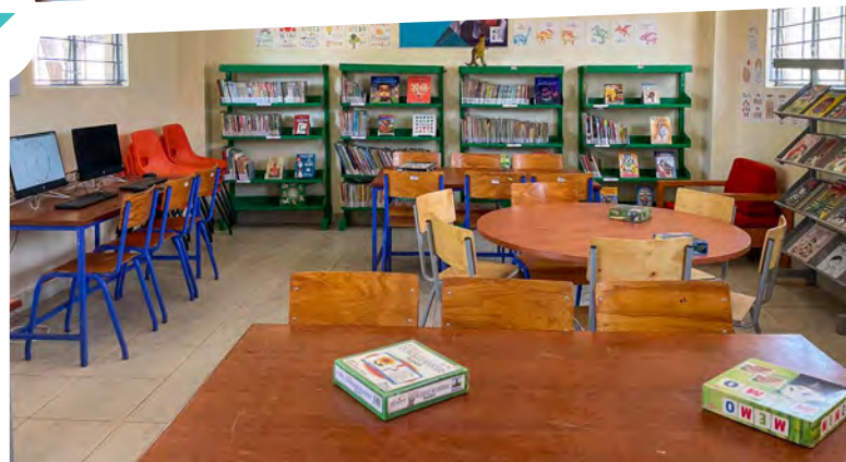
Photos of the Library After Upgrade in 2024