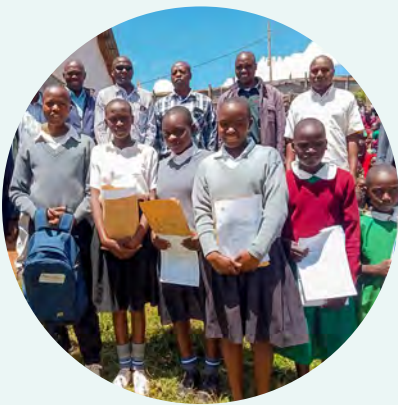
CHESBIAN PRIMARY SCHOOL