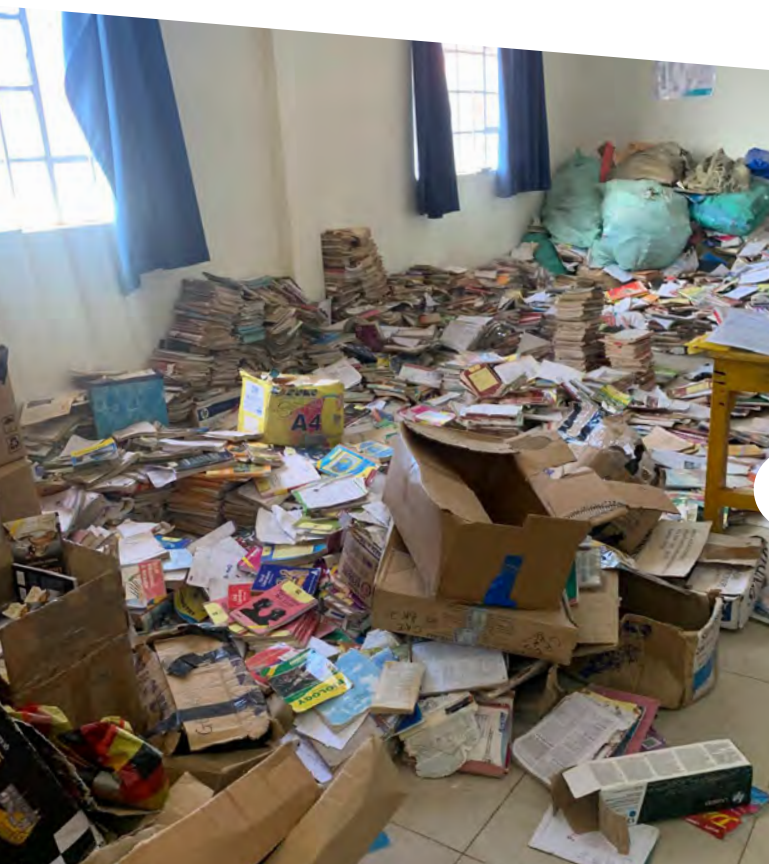
A Section of the Library With Old Books in 2023