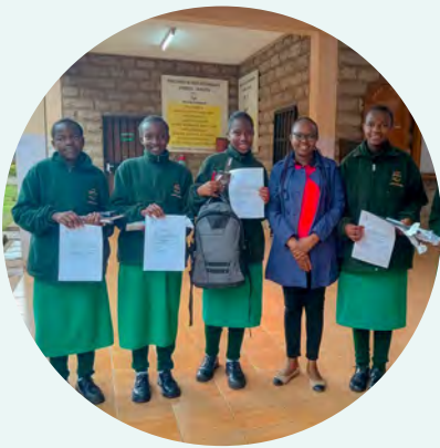
PRECIOUS BLOOD RIRUTA